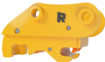
HKR Excavator Coupler